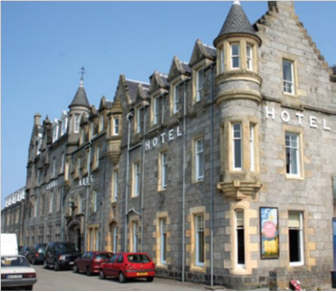
Grant Arms Hotel

Originally this was a low two storey inn which had developed from an unsuccessful 1765 linen manufactory and then in 1766 a “brewing, baking and butchermeat” business.